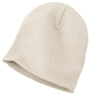
Knit Skull Cap 100% acrylic $15