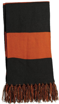
Spectator Scarf 100% acrylic $20

All items will be embroidered with the Newmeadow logo (above). The logo will appear on the left breast of all clothing.